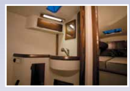
A head of its time.