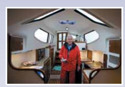
Skylit and satisfied client.