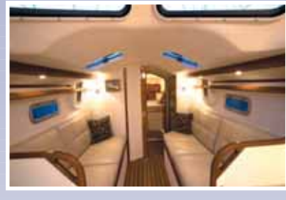
Cruising comfort for two.